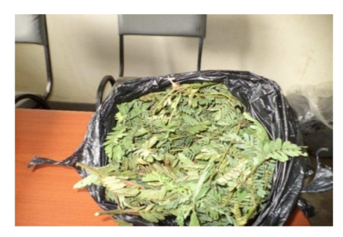
Figure 1. Fresh leaf sample of Cassia nigricans.